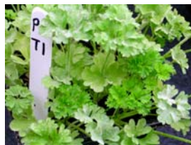
Powdery mildew on parsley