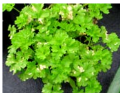
4 days after 2nd spray