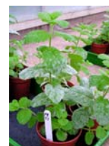
Powdery mildew on apple mint