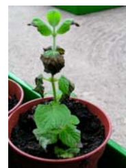
4 days after 2nd spray